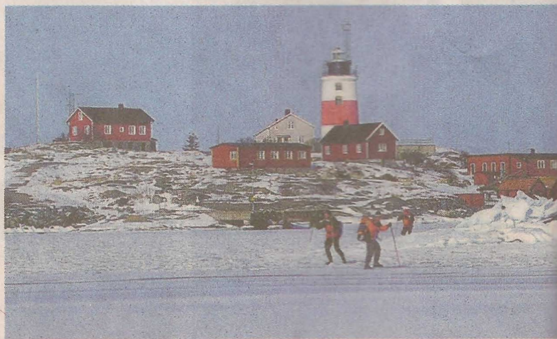
Top, houses in Sandhamn; below, skaters at the Söderarm lighthouse on the island of Torskär, on the archipelago's northern edges.